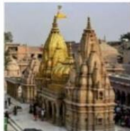
Vishwanath Temple Varanasi

Senior Professor & Vice- Chancellor, Mahayogi Guru Gorakhnath AYUSH University, Gorakhpur